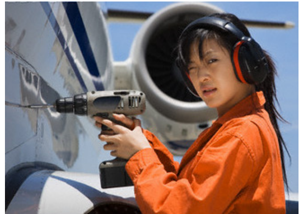
Staff at the Sharp End need the right tools for the job!

Myriad Optima Ltd. Reg. Office: 3 Chiltern Works, Chiltern Drive, Surbiton, KT5 8LS T 0800 046 7404 E info@skylineSitRep.com W www.skylinesitrep.com