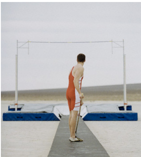
The bar has been raised and Skyline is fit for the new purpose!

Apart from death and taxes, one other certainty in life is that "Information is King!" But doesn't it seem that an ever increasing amount of data has to be collected, regularly and repeatedly? Don't such exercises invariably appear to be thankless, time-hungry and therefore expensive tasks? Don't they seem to be made worse because the results are often out of date or just inadequate and not fit for purpose?